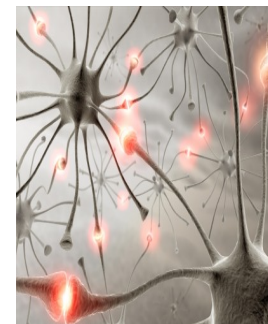
Electrical System of the Brain